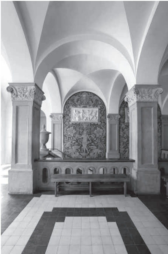
Classes are held in University historic buildings.

includes: tuition, Polish language textbook, and non-refundable 500 PLN prepayment